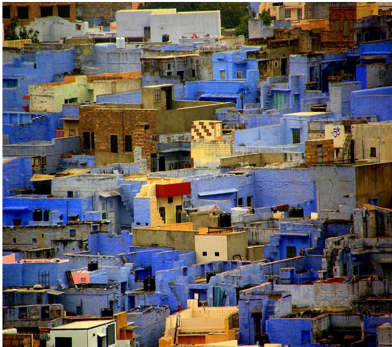
Blue City from Mehrangarh Fort

Day 8 Udaipur: Spend the rest of the day exploring this charming lake city by car. Wander through the opulent City Palace grounds and the museum, which are a testament to the valour and chivalry of the Mewar rulers. Visit the Jagdish temple on the shores of Lake Pichola. The breathtaking beauty of the lakes- Pichola & Fateh Sagar truly make Udaipur an oasis in the desert. Return to hotel after city drive. Dinner & overnight stay at the hotel. ON Udaipur.