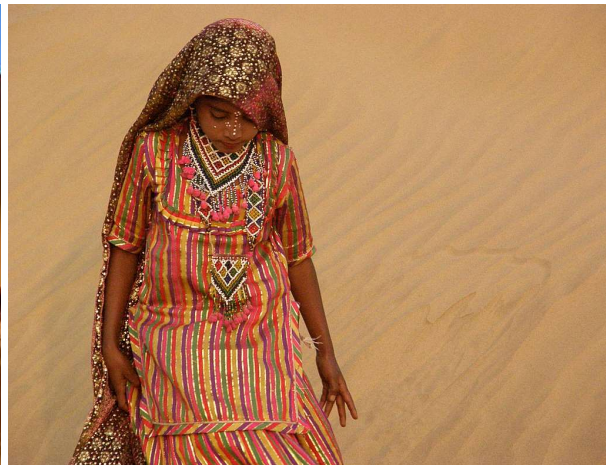
Jaisalmer Sand Dunes

Day 5 Jaisalmer: After breakfast, walk around Jaisalmer Fort, the monolith of stone, built in 1156 atop the 80 m high Trikuta hill, is the only raised feature in a flat desolate area. We will meander through alley ways lined with havelis sporting great intricate hand-carved sand stone latticed balconies and archways. After lunch around 1300 hour drive to the start point of our camel safari through the villages to sand dunes. ON Khuri.