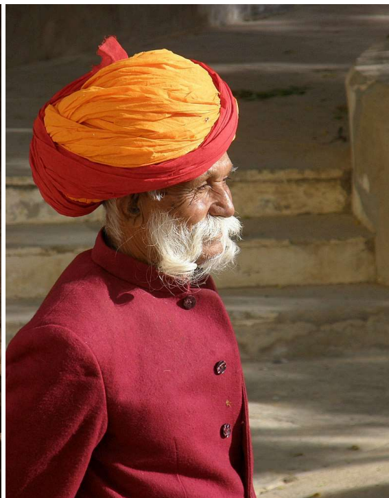
Jaisalmer Living Fort